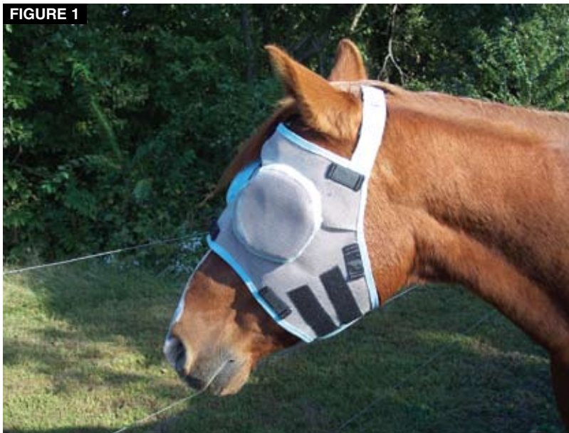
A commercial mask with protective lenses.