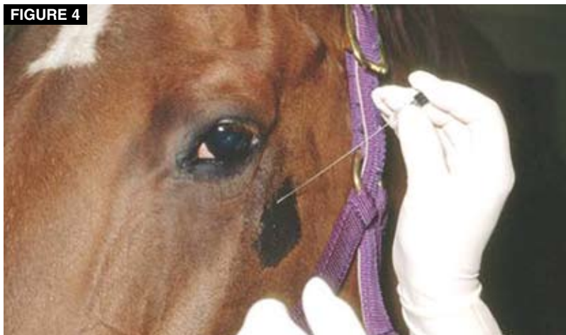
Posterior ethmoidal nerve block. A 7-cm, 19-gauge spinal needle is inserted below the zygomatic arch and directed rostrally and ventrally toward the upper sixth cheek tooth.